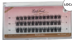
Best lash kit LashXtend DIY Extensions Starter Kit R450, lashxtend.co.za