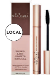
Best lash growth mascara MUSTCARA Brown Lash Growth Mascara R415, mustcara.co.za