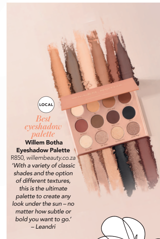
Best eyeshadow palette Willem Botha Eyeshadow Palette R850, willembeauty.co.za 'With a variety of classic shades and the option of different textures, this is the ultimate palette to create any look under the sun - no matter how subtle or bold you want to go.' - Leandri