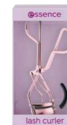
Best lash curler essence Lash Curler R69.95, Clicks