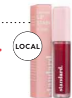
Best lip stain Standard Beauty Ceramide Lip Stain R145, standardbeauty.co.za