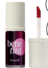
Best multi-use tint Benefit Benetint Cheek & Lip Stain R370, ARC