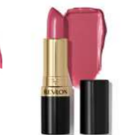
Best cream lipstick Revlon Super Lustrous Lipstick R170, Superbalist 'A cult lipstick for a reason - moisturising, long-lasting and doesn't budge on colour pay-off.' - Leandri