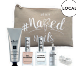
Best nail care kit Elim Spa #NakedNails care kit R865, elimspaproducts.co.za

'Nails take an old outfit and make them new' - Essie Weingarten