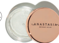
Best brow mascara Anastasia Beverly Hills Brow Freeze R470, ARC