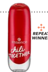
Best colour polish essence Chill Together Nail Colour R30, Clicks