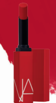
Best velvet matt lipstick NARS Power-matte High Intensity Lipstick R645, ARC