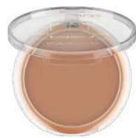
Best matt bronzer Catrice Sun Glow Matt Bronzing Powder 035 Universal Bronze R71, Clicks