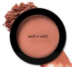
Best blusher Wet n Wild Color Icon Blush R94.95, Clicks