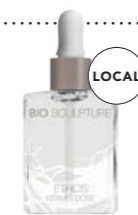
Best strengthening treatment Bio Sculpture ETHOS Vitamin Dose R140, biosculpture.co.za 'A healthy dose of topical vitamins for your nails, this is amazing for weak nails.' - Jade