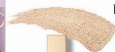
Best liquid eyeshadow Stila Shimmer & Glow Liquid Eye Shadow R475, Superbalist