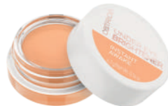
Best under eye brightener Catrice Under Eye Brightener R100.95, Dis-Chem 'This definitely surprised me at just how well it brightened my eye area. Great product!' - Candice