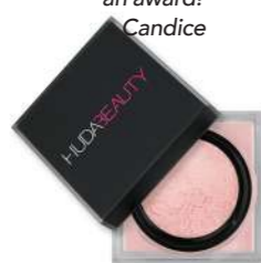
Best setting powder HUDA Beauty Easy Bake Loose Powder R855, ARC