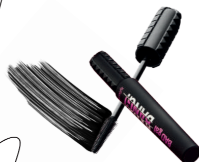
Best mascara Benefit BADgal BANG! Volumizing Mascara R515, ARC 'This mascara is next level amazing. Just one coat gives you defined, luscious lashes!' - Carishma