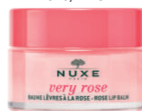
Best lip balm NUXE Very Rose Lip Balm R345, orleanscosmetics.co.za